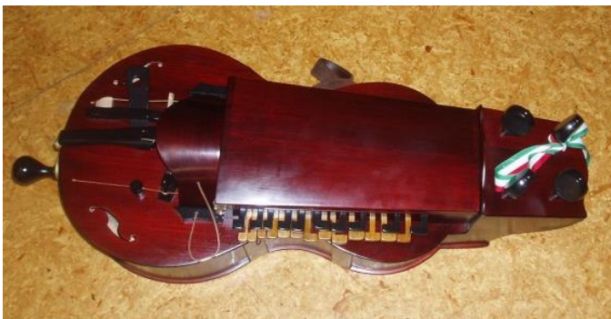
Rob's hurdy gurdy