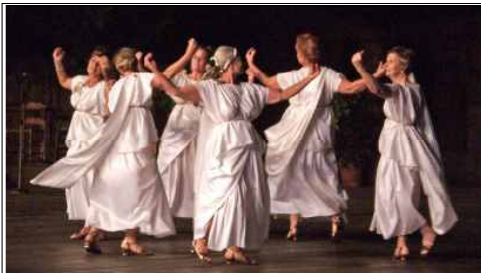
The group dancing the "suk/bazaar"

Considerable research also went into the design of the chitons worn by the Maenads during the performance.