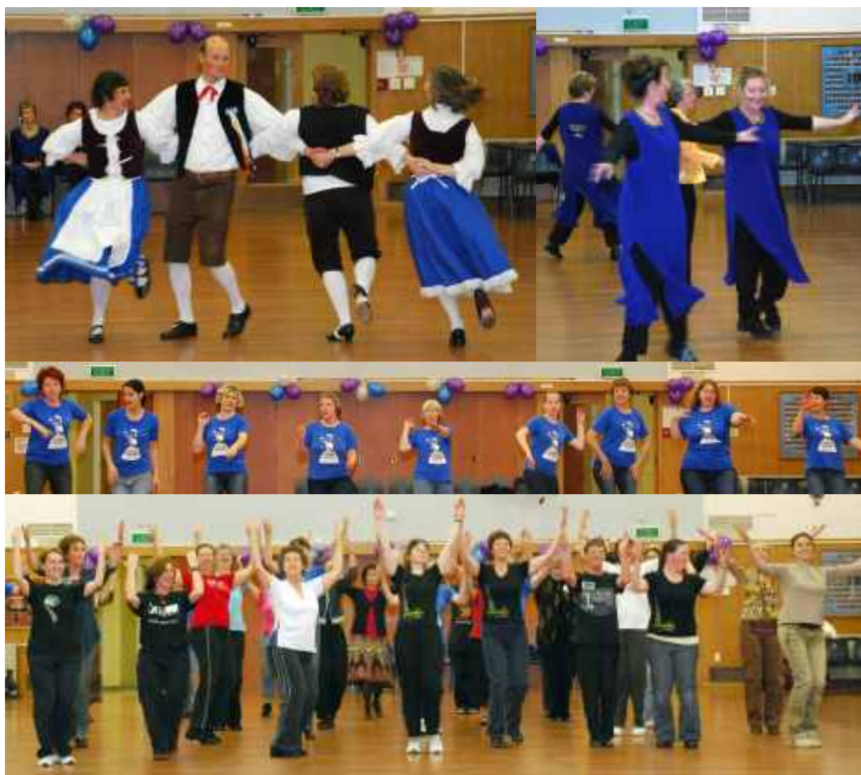
Top Left: Hawke's Bay International Dancing Group Top Right: Nelson Israeli Dance group Centre: Wellington Israeli Dance group Bottom: choreography workshop